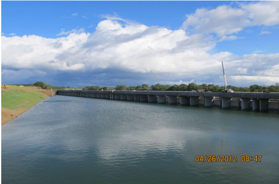
Forebay filled with water, looking from Pumping Plant upstream at backside of Fish Screen.