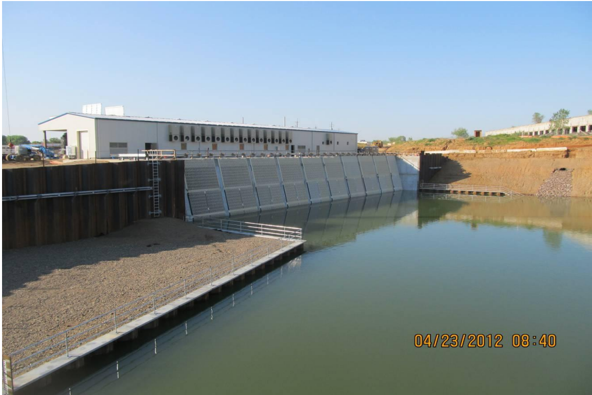
Forebay filled with water to elevation 242.5, looking from Fish Screen to Pumping Plant.