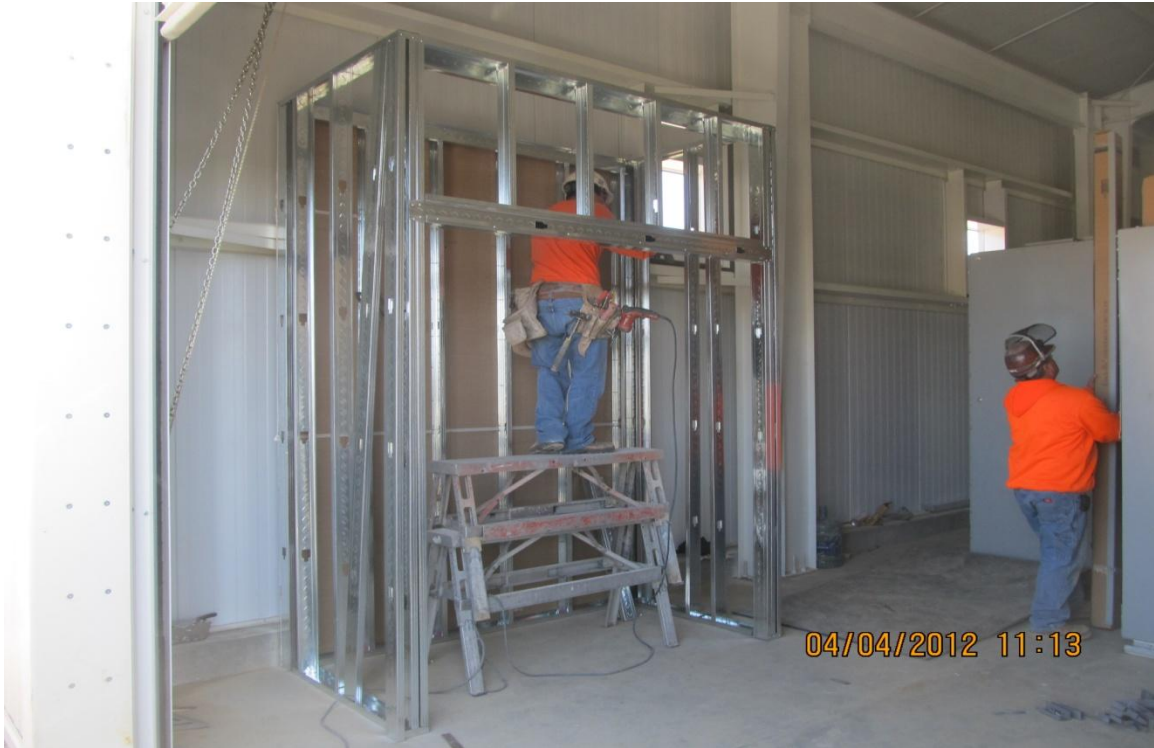
Subcontractor Construction Specialties erecting battery room inside the switchgear room.