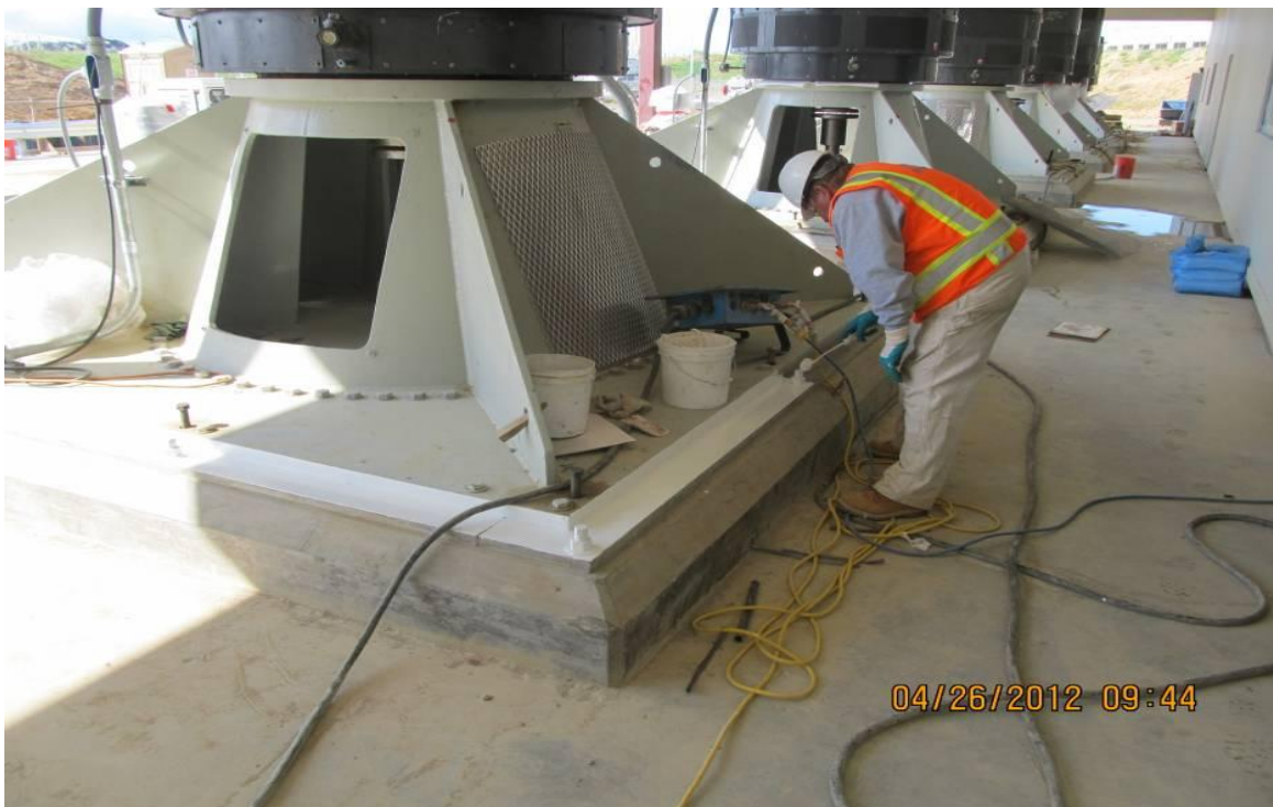
Subcontractor FD Thomas coating top of motor sole plate.