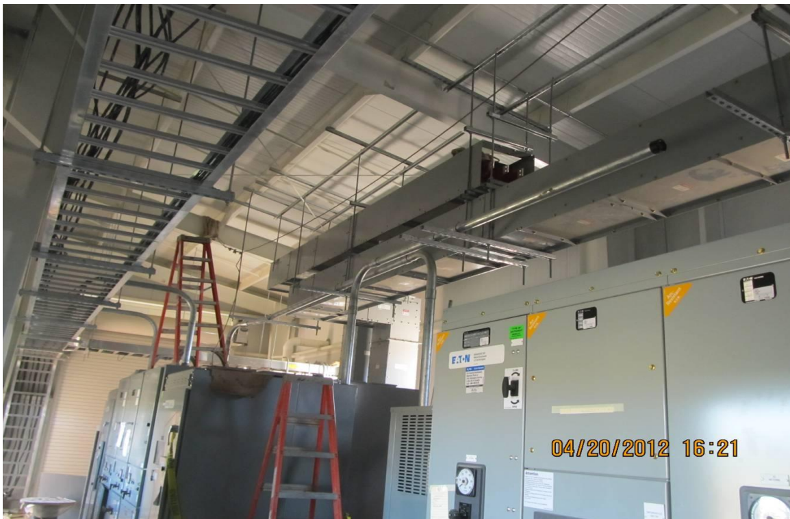
Inside switchgear room of the non-segregated bus and conduit running from unit UCA to transformers.