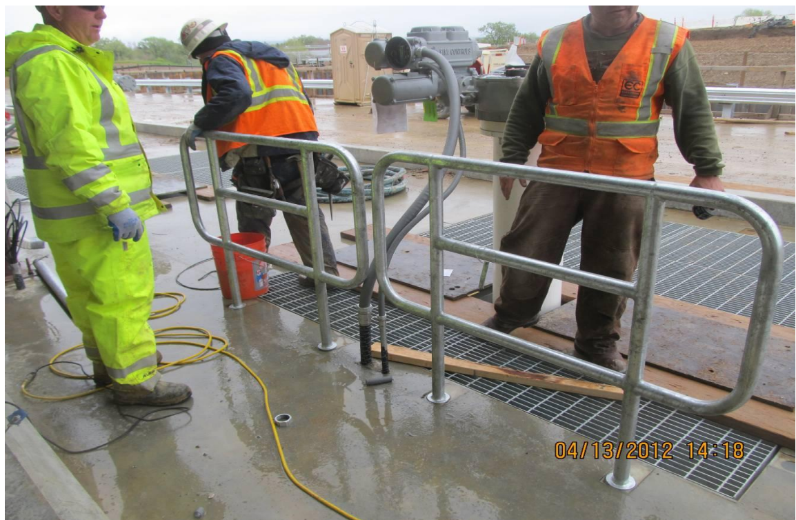
Fitting up the flexible conduit to the butterfly actuators using the removable handrail.