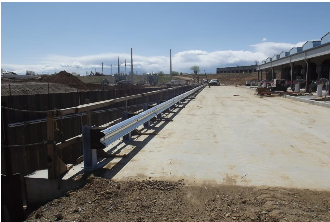
Metal guardrail beam installed along the afterbay deck of Pumping Plant.