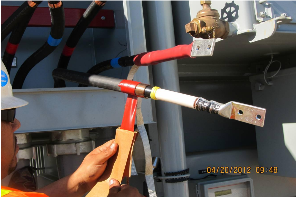
Subcontractor Harreld's Hi-Voltage terminating the medium voltage cables in the 69 kV transformers.