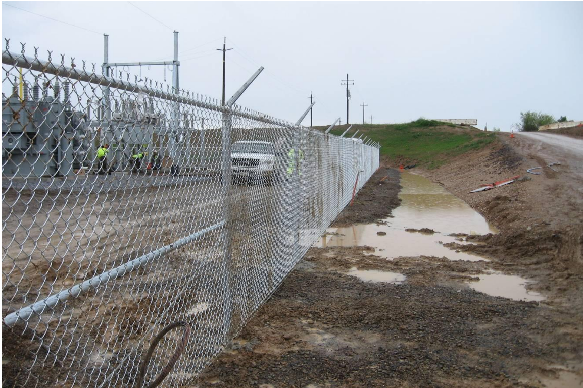
Subcontractor All Commercial Fence erecting fence around Switchyard.